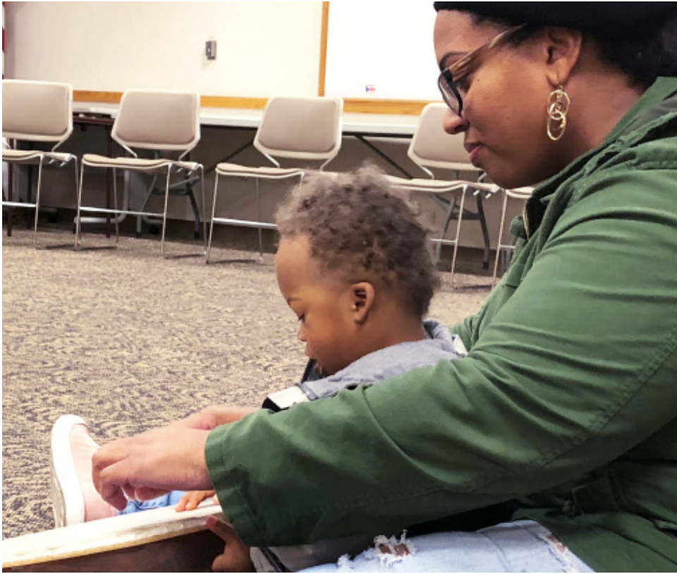
A family drums together at Music Therapy & More in Elyria.